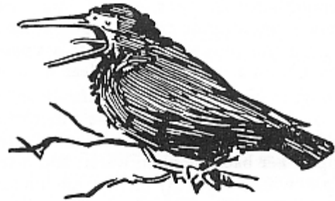
The crows seem to be everywhere with their loud “Caw-caw.”

“I could have been an ‘ornithologer’ myself, because I always loved birds and creatures. And I started out to learn how to be one. I saw a bird sitting on a dead limb of a high tree, singing away with his head tilted back and his mouth open—and before I thought I fired my gun at him. His song stopped all suddenly, and he fell from the branch, limp like a rag, and I ran and picked him up—and he was dead. His body was warm in my hand, and his head rolled about this way and that, like as if his neck was broke, and there was a white skin over his eyes, and one drop of red blood sparkled on the side of his head—and—laws! I couldn’t see nothing for tears. I haven’t ever murdered no creature since then that warn’t doing me no harm—and I ain’t agoing to neither.”