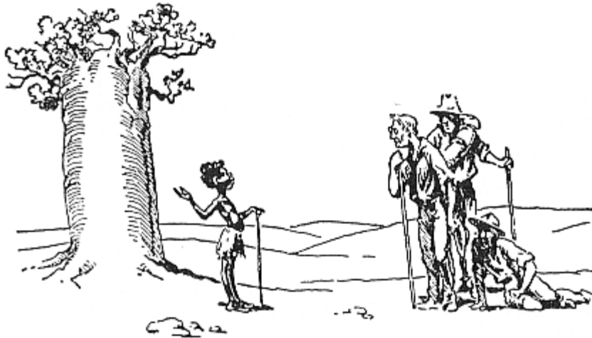
A small native girl came to the aid of the scientific professors who ran out of water when hiking in the wilds of Australia.

In this way the wild little imp of the desert taught the learned gentlemen a valuable bit of knowledge which with all their school and college education they did not possess.