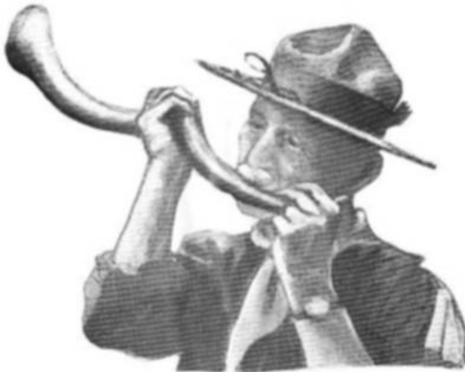
THE KUDU HORN

other men with whom they had to work. His army career was drawing to a close, and in it he had fulfilled all his desires as a boy.