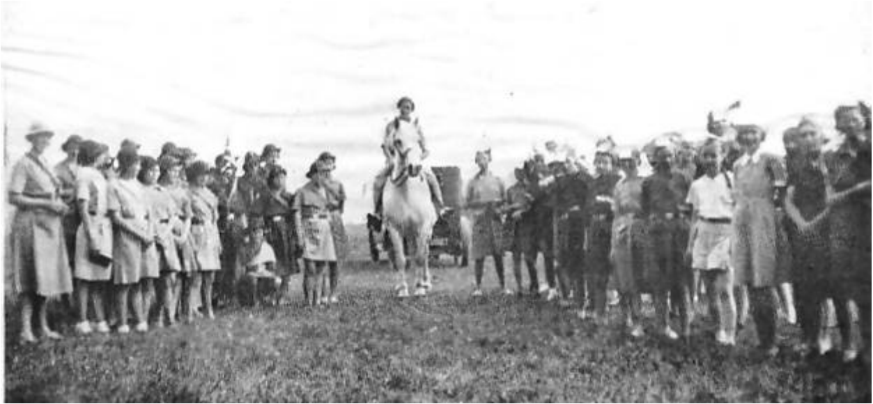
THE AUTHOR PREPARING FOR A WIDE GAME