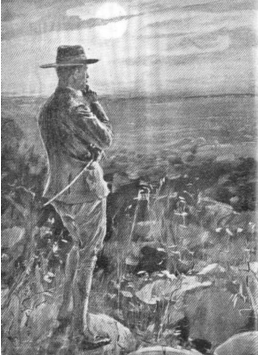
THE WOLF THAT NEVER SLEEPS