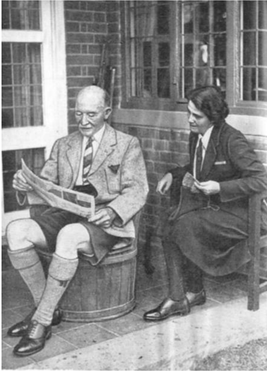
PAX HILL — WITH THE CHIEF GUIDE, 1937